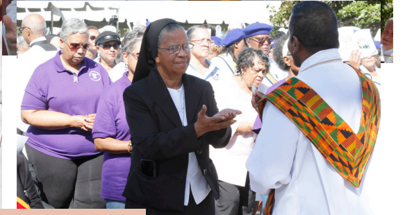
Centennial Closing Celebration of St. Augustine October 29, 2023