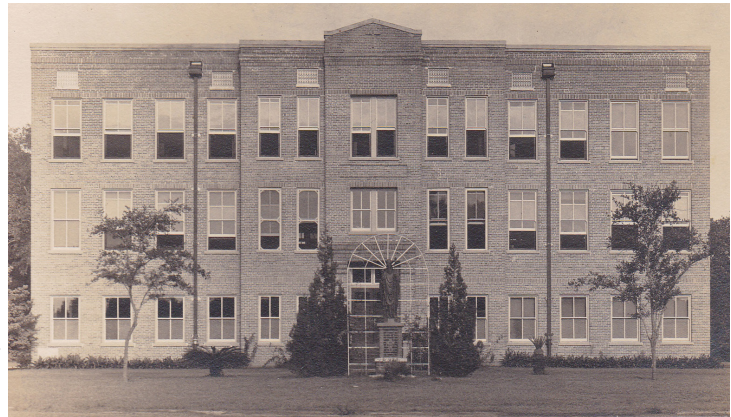
Minor Seminary Building Dedicated September 16, 2023

We give thanks for St. Augustine's Seminary – A building that stood majestically and tall for over 75 years, a building where high school seminarians lived and studied, where African American students were trained and formed as they discerned the call to be priests and Divine Word Missionaries – despite the odds!