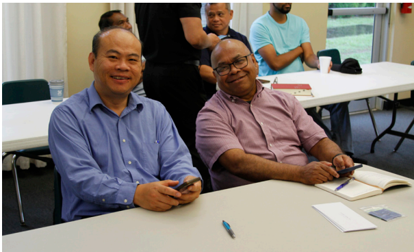
Enjoying one another's company