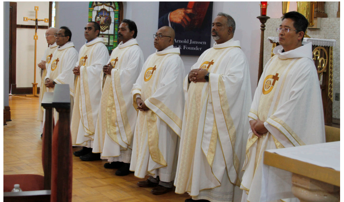
Jubilarians who celebrated anniversary of vows and ordination