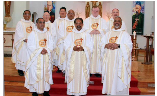
Jubilarians after Mass