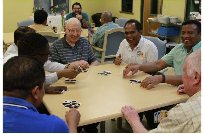
Nothing like a good game of cards