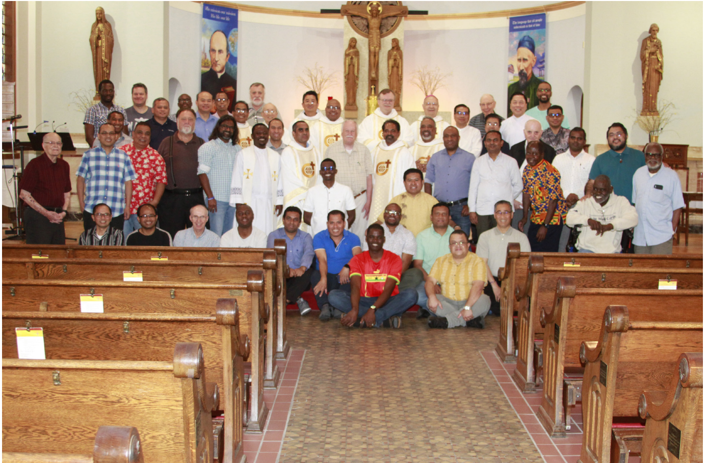
Divine Word Missionaries of the USA Southern Province

On these pages we highlight the Divine Word Missionaries as they spent time in Bay Saint Louis for their annual retreat.