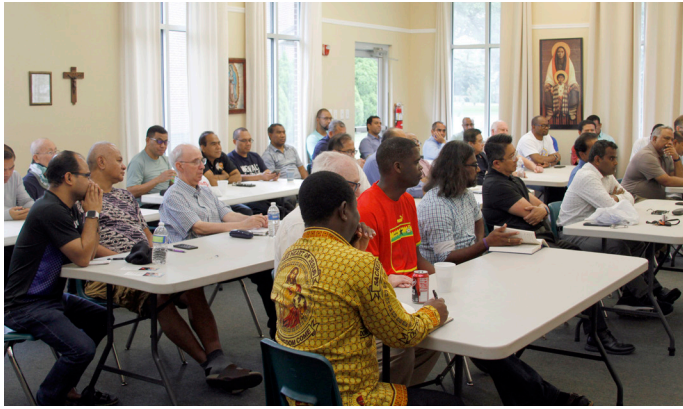
Listening to conferences