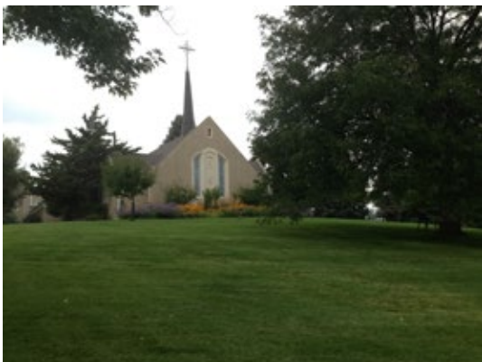
Front cover photo from Sacred Heart Jesuit Retreat House in Sedalia, Colorado