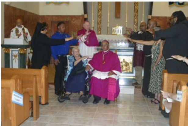
Blessing the new Bishop