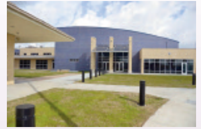
Finally, after five years the new St. Mary's Academy is complete